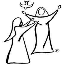
Visitation Scene: Luke 1:39